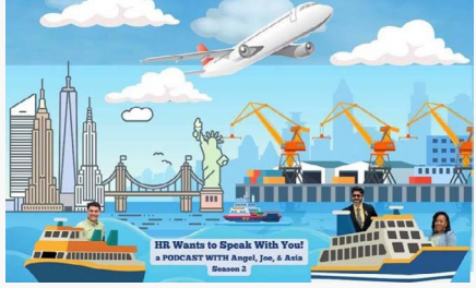
Kick off Friday mornings in style by tuning in to HR Wants to Speak With You – the biweekly HR podcast delivering the latest agency news, HR updates, and much more... including best-in-class banter courtesy of Joe Monte, Angel Velez , and Asia Mazara .