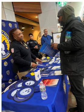
YSU staff speaking with travelers on January 9.

It can happen in any community and victims can be any age, race, gender, or nationality. Traffickers might use violence, manipulation, or false promises of well-paying jobs or romantic relationships to lure victims into trafficking situations. Usually, language barriers, fear of their traffickers, and/or fear of law enforcement frequently keep victims from seeking help, making human trafficking a hidden crime.