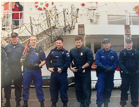
Second from right, joint U.S. Coast Guard/ Customs and Border Protection boarding team. 2003.