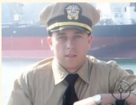
Aboard USS Juneau (LPD 10). 2005.