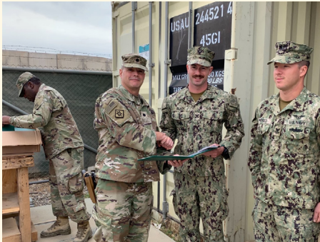
Middle, receiving army achievement medal. 2022.