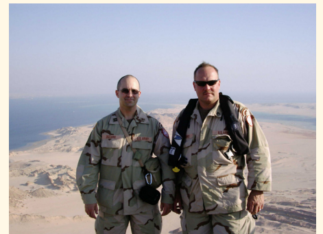
Right, at an outpost on Tiran Island, Saudi Arabia. 2004.

General Maintenance Supervisor, Aviation 1st Lieutenant, National Guard (Army), New Jersey