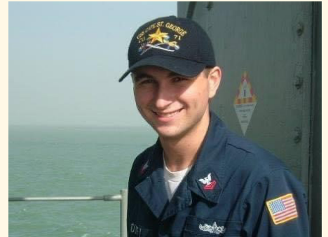
Center, supporting Operation Iraqi Freedom, guarding the 2 main oil terminals off the coast of Iraq. 2006.