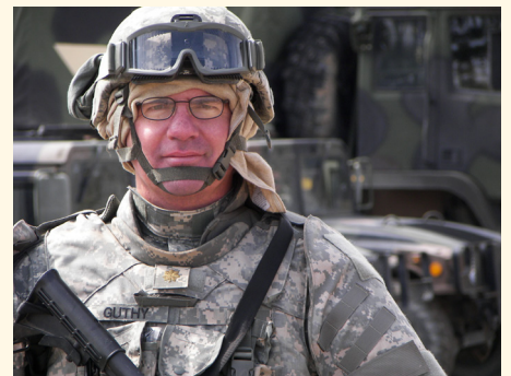
Field training exercise prior to Afghanistan deployment. 2008.