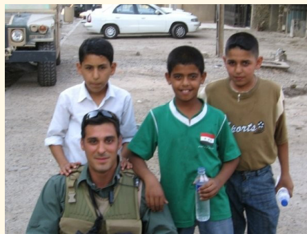
Providing protection detail during meeting with an Iraqi minister. 2006.

Security Manager, Chief Security Office Marine Corps