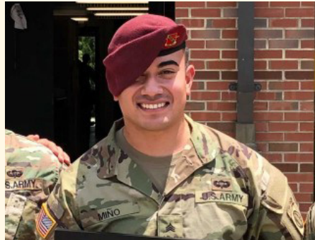
Paratrooper who left active duty to join the NJ National Guard Military Police Co. 2020.