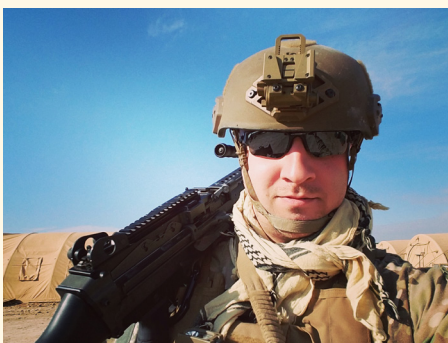
Operation Inherent Resolve, mission to thwart ISIS, Syria. 2017.