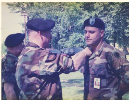
Right, promotion ceremony from First Lieutenant to Captain. 2003.