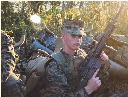
Attending School of Infantry at Camp Lejeune, NC. 2005.

Police Officer, PAPD Sergeant (USMC)/Technical Sergeant (USAF), National Guard (Air), New York, Marine Corps