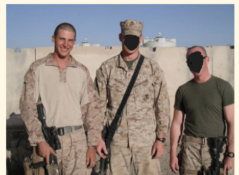
Left, the three forward observers of 3rd Battalion 5th Marine Regiment at Camp Leatherneck, entering Sangin, Afghanistan. 2010.