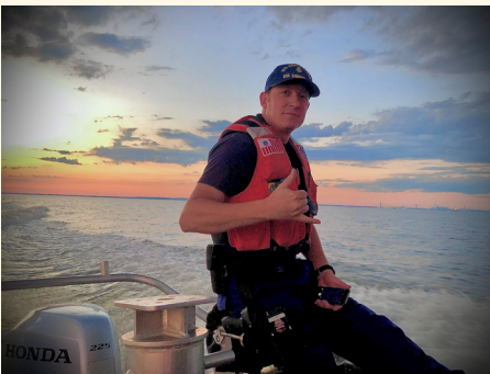
Conducting evening area familiarization training while on maritime law enforcement and search and rescue patrol at USCG Station, Sandy Hook, NJ. 2020.

Northeast Regional Account Manager, Port Petty Officer 1st Class, Coast Guard