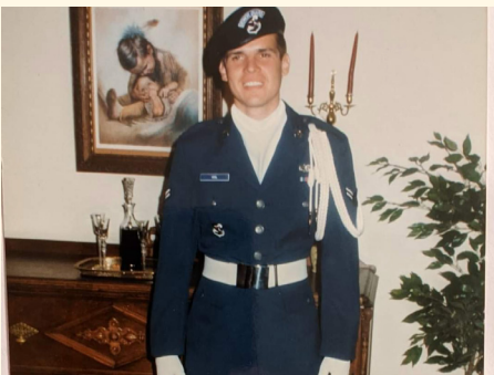
In the Elite Honor Guard. 1987.