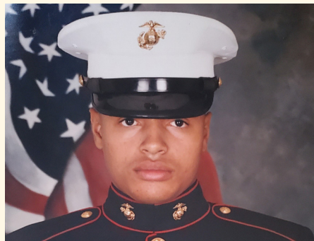
Center, graduation from Marine Corps Recruit Depot, Parris Island, SC. 1986.

Assistant Police Chief, PAPD Sergeant/E-5, Marine Corps