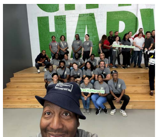
Brooklyn Bridge Park