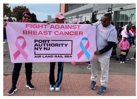
NBE members at a prior year's walk.

The fundraiser will be open through October 31. The EBRGs aim to raise $5,000 this year. Although there is no Port Authority walking group, the EBRGs