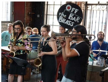
Local band Off the Bar Brass performing