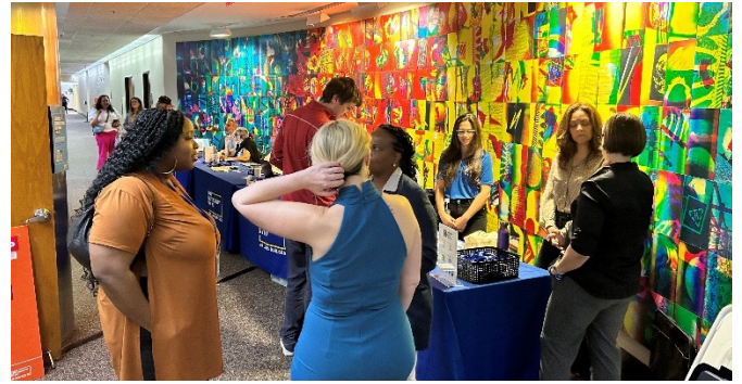
A facility visit at PATC in early June

Over the past few months, representatives from various agency departments have been visiting Port Authority facilities to connect with employees face-to-face on the issues that matter most to them, ranging from employee benefits to the upcoming launch of an all-new employee portal.