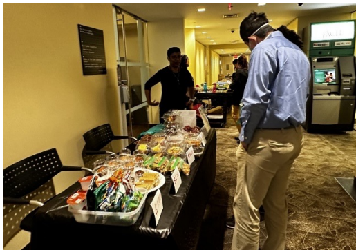
A previous NBE bake sale